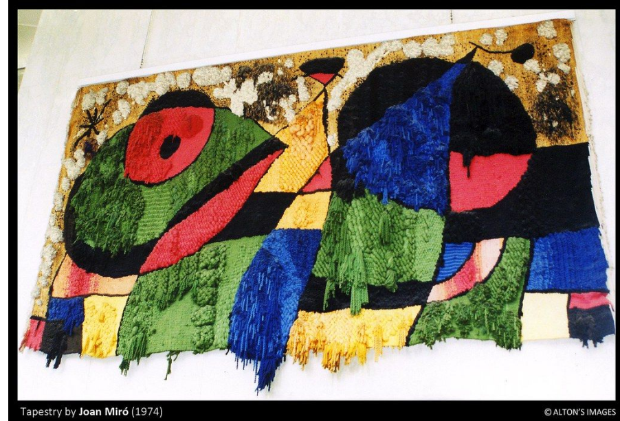
World Trade Center Tapestry, 1974